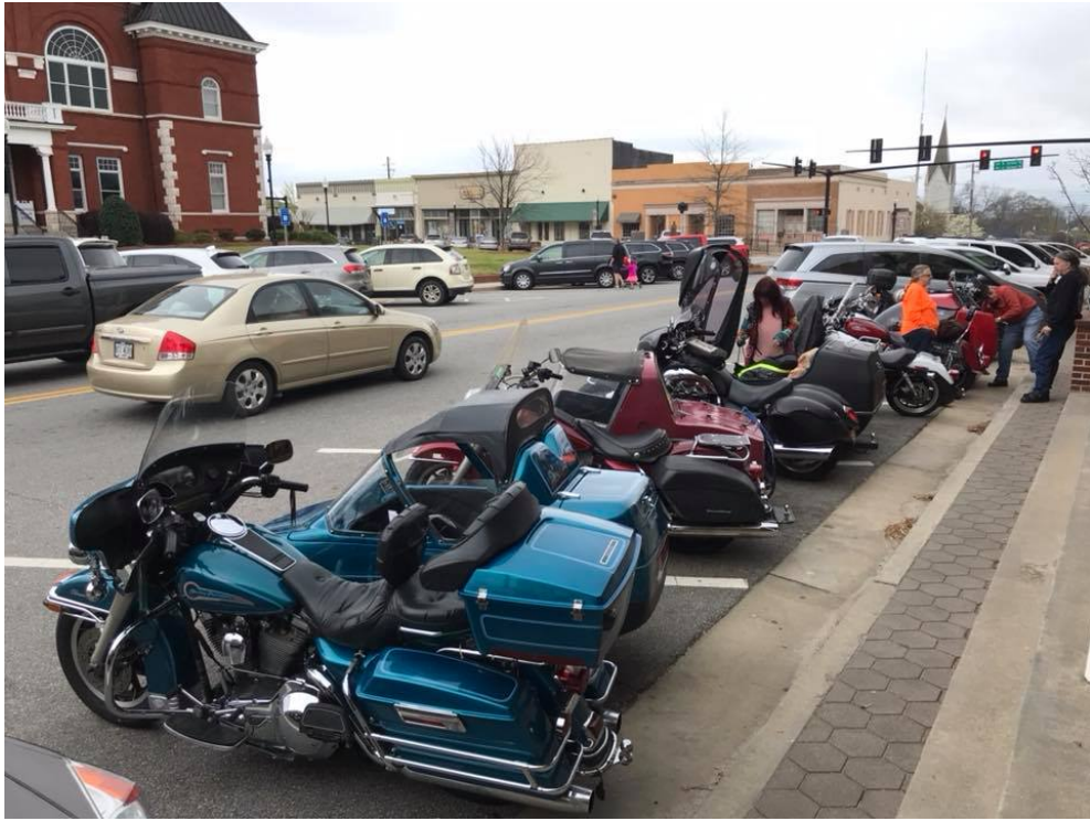
Lineup at Grits Cafe